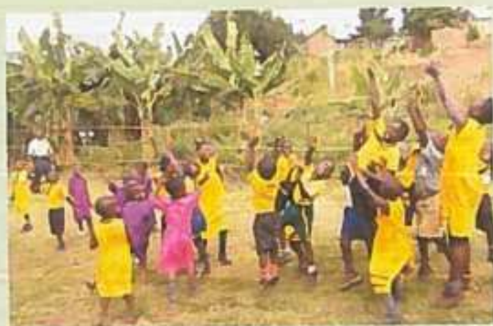
Pupils of King's Grace Junior School playing at Breaktime.