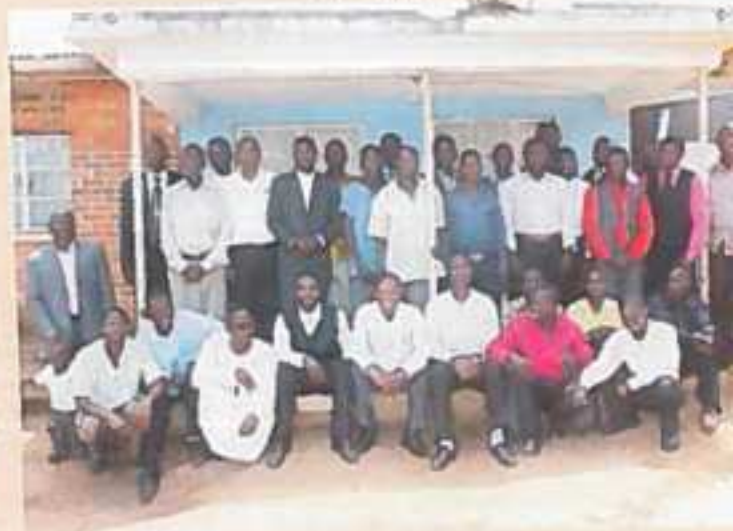
The Men's Ministry