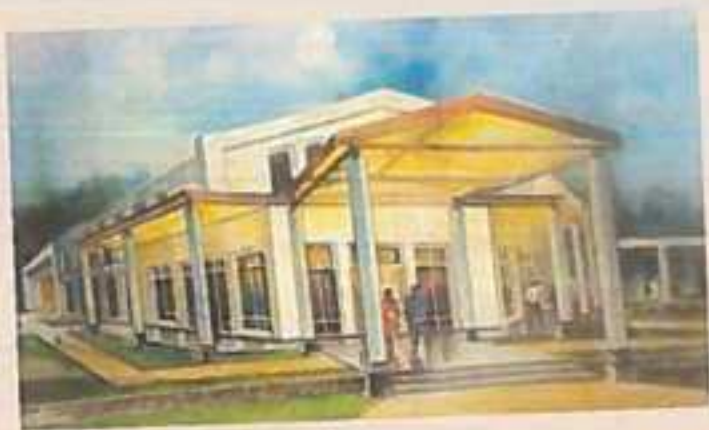
Artist's impression of Victory Word of Faith Cathedral