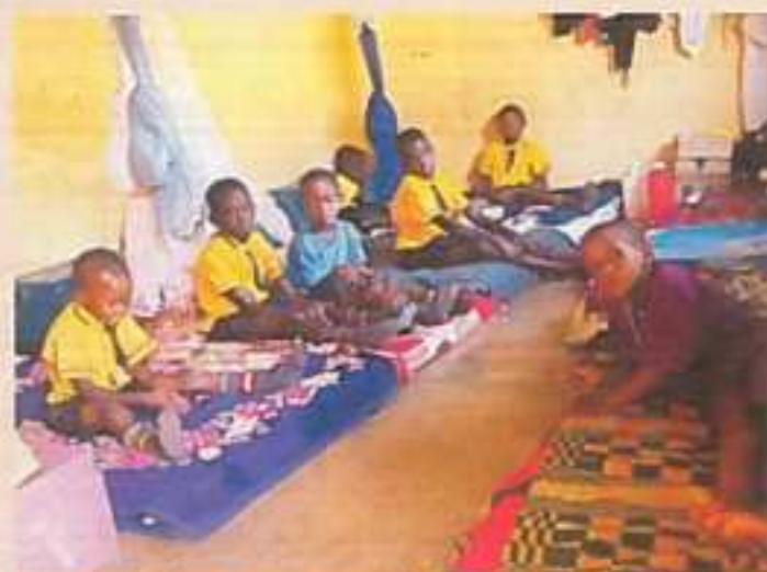
Orphans occupying the existing residence