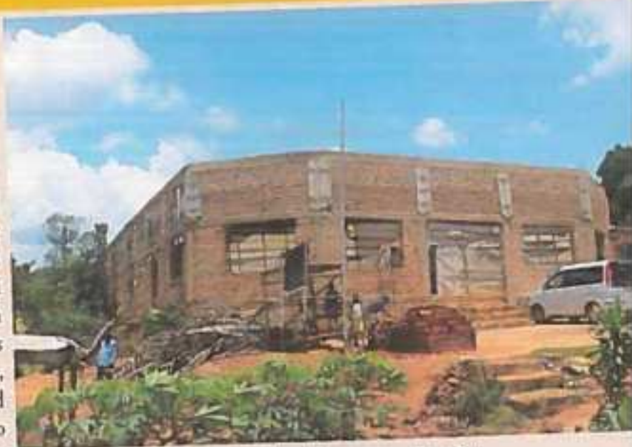
The Cathedral as it stands today