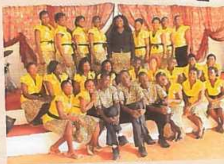
The Mass Choir.