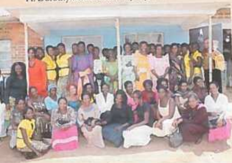
The Women's Ministry