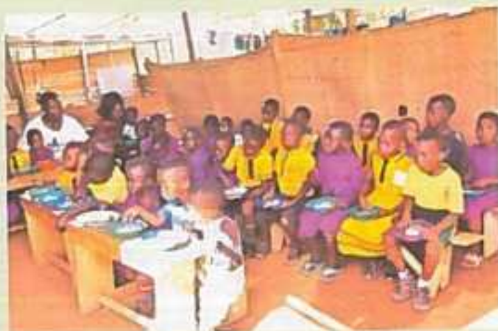
Pupils of King's Grace Junior School at Lunch.