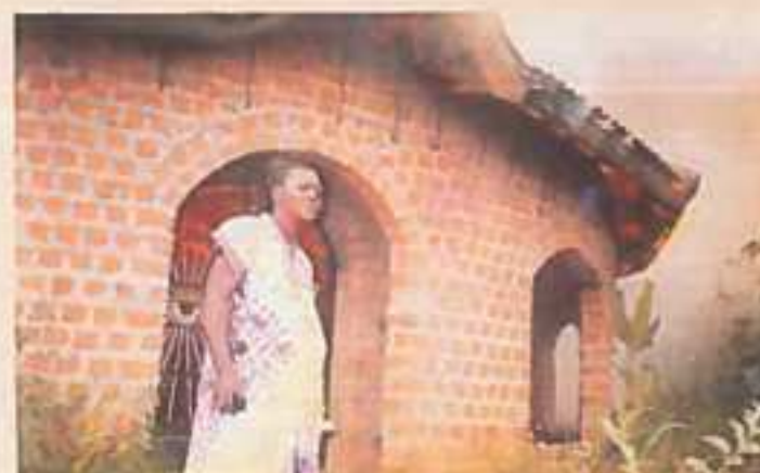
The shrine set ablaze!