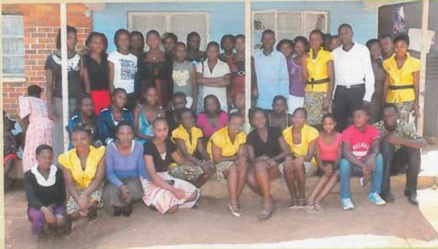
The Youth Ministry

Did you know that you are blessed to bless?